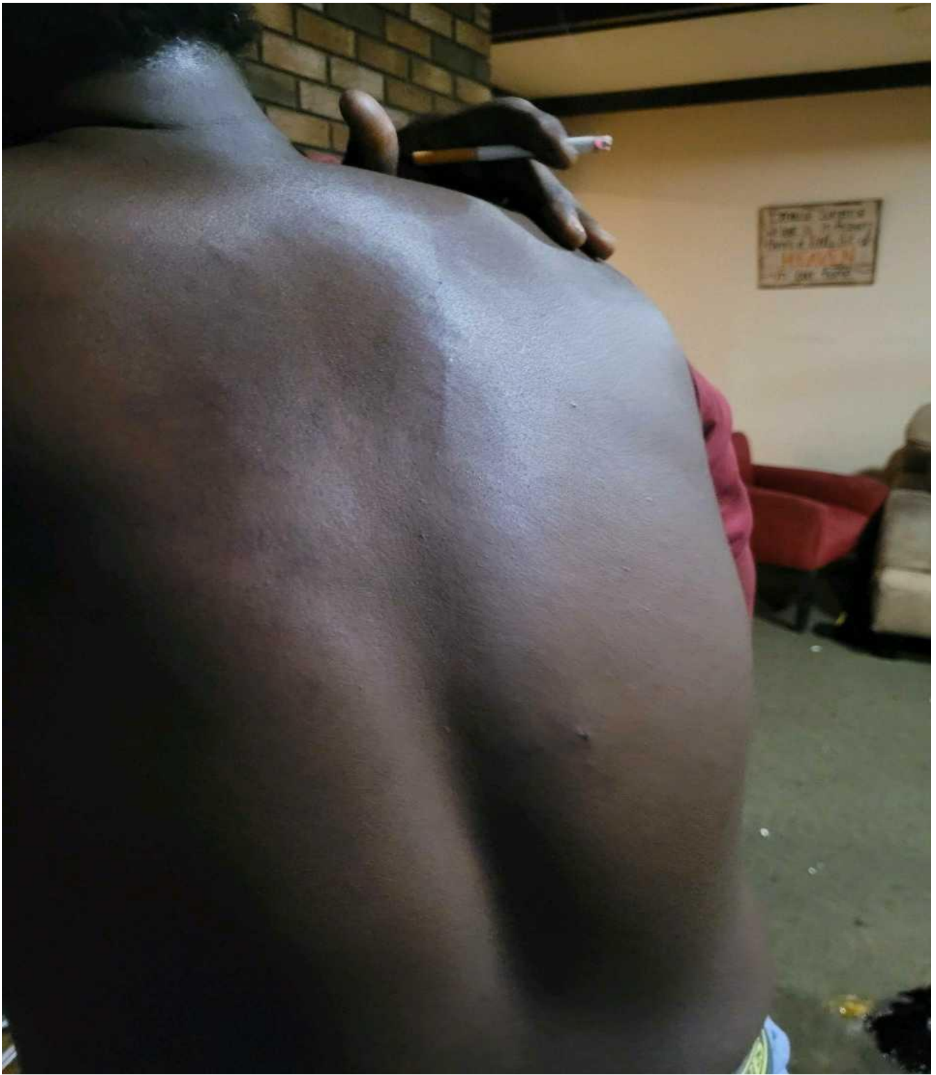
EXHIBIT 11 Eddie Parker BLACK LAWYERS FOR JUSTICE