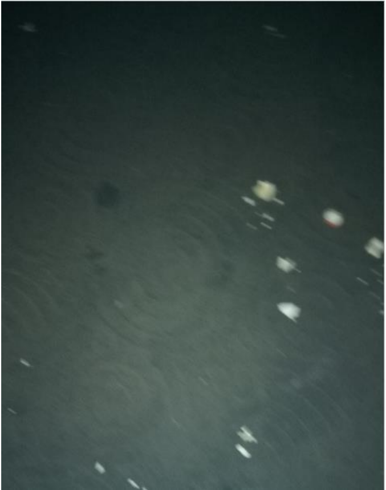
EXHIBIT 6 CRIME SCENE 2 - EGGS BLACK LAWYERS FOR JUSTICE