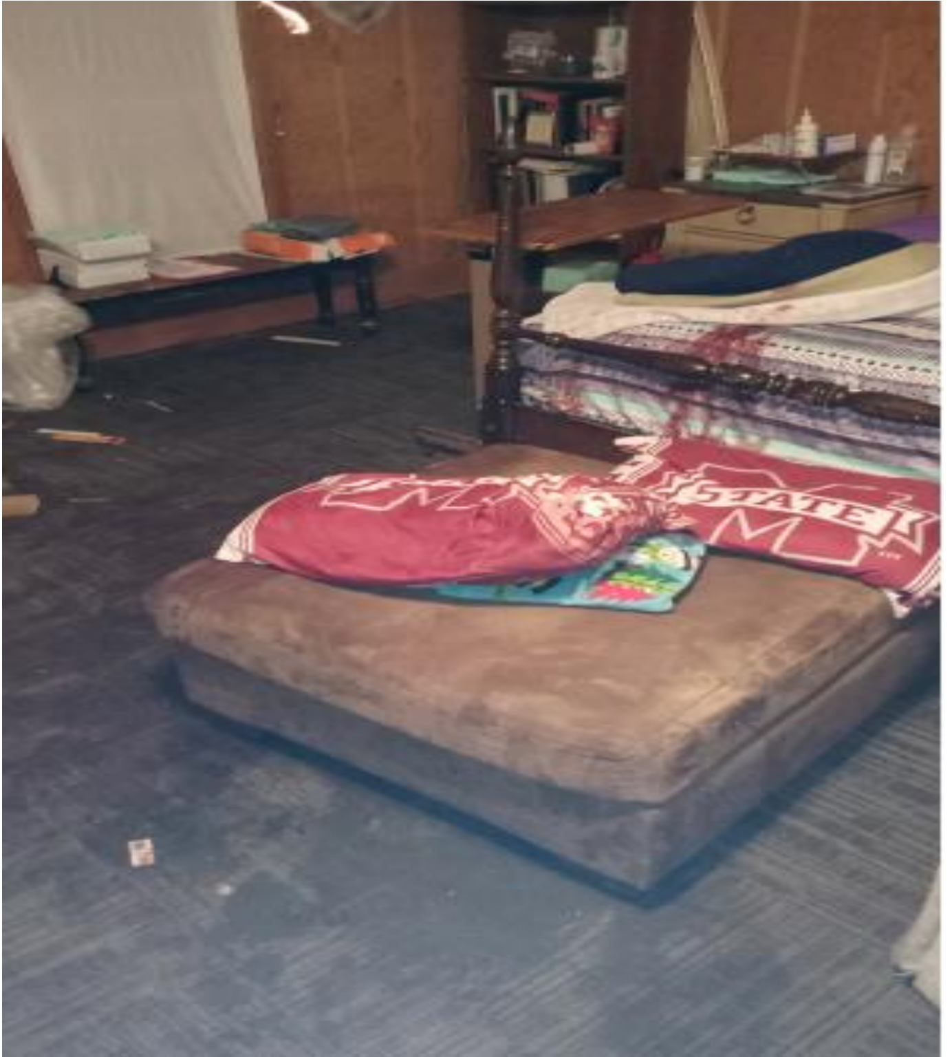
EXHIBIT 9 CRIME SCENE BLACK LAWYERS FOR JUSTICE