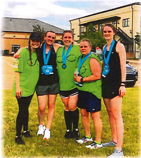
Female Trusty's at 5k run